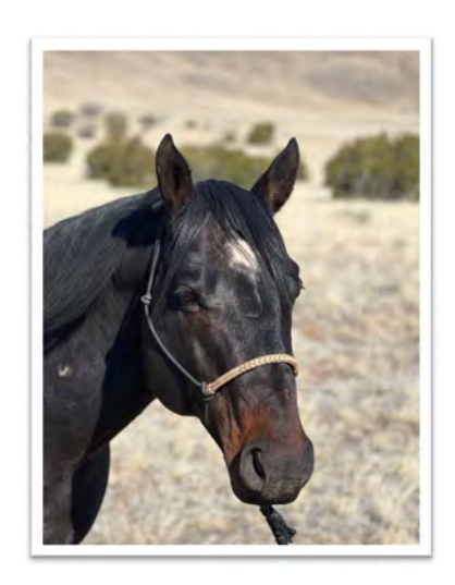
CABALLO DRIFT 2014 Brown Reference Stallion