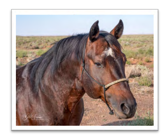
POQUITO JO JO 2007 Bay Reference Stallion