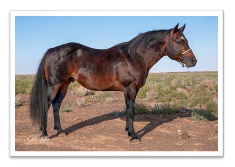
POQUITO JO JO 2007 Bay Reference Stallion