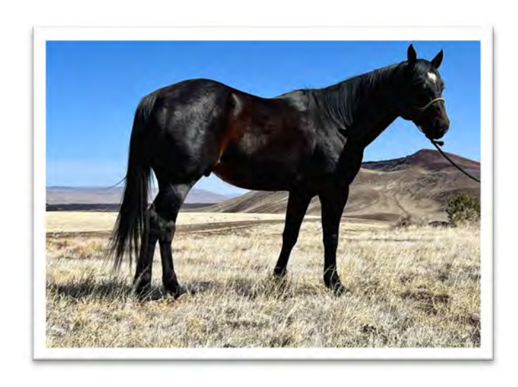
CABALLO DRIFT 2014 Brown Reference Stallion